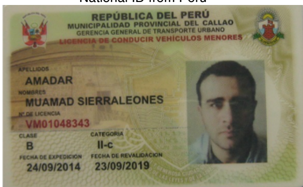
National ID from Peru