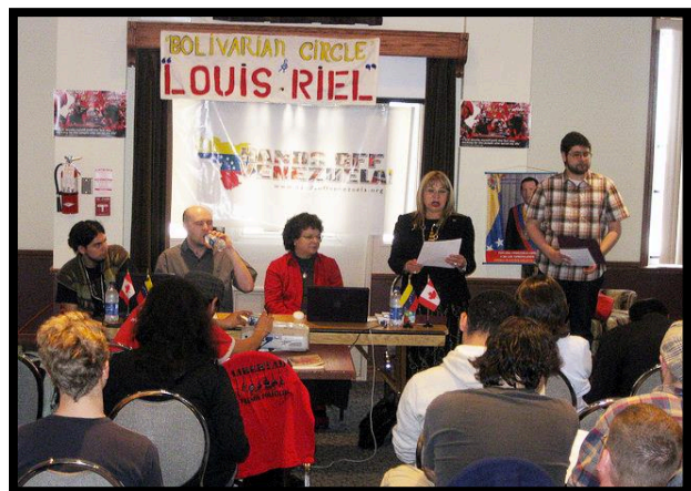
The Consul General of Venezuela to Canada (second from the right) offers greetings to a meeting of the Bolivarian Circle Louis Riel in Toronto, Ontario, Canada.

contact with 'patrols' from the ruling United Socialist Party of Venezuela (PSUV), from which it 'regularly receives information.' 50 Similarly, Avanzada Bolivariana pledges to be 'on permanent alert and in solidarity' with Venezuela, 51 and the Hugo Chávez Peoples' Defense Front takes as its objective 'to support the diplomatic body of the Bolivarian Republic of Venezuela in Canada.' 52