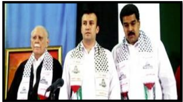
From left to right: former Venezuelan Vice President José Vicente Rangel, former Interior Minister and current Governor of Aragua state Tareck El Aissami, and the current President and former Foreign Minister of Venezuela Nicolás Maduro, at the Ibrahim Al-Ibrahim Mosque in Caracas on January 6, 2009.