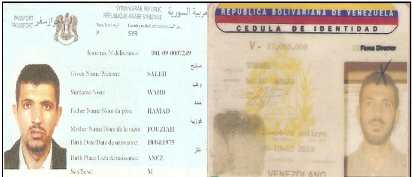
Figure 2: Fraudulent Venezuelan Identification Card

Syrian national issued a fraudulent Venezuela national ID changing the identity of the individual with a new birthdate and name. According to multiple former Venezuelan immigration officials, more than 10,000 Middle Easterners have been given similar fraudulent IDs from the Venezuelan government.